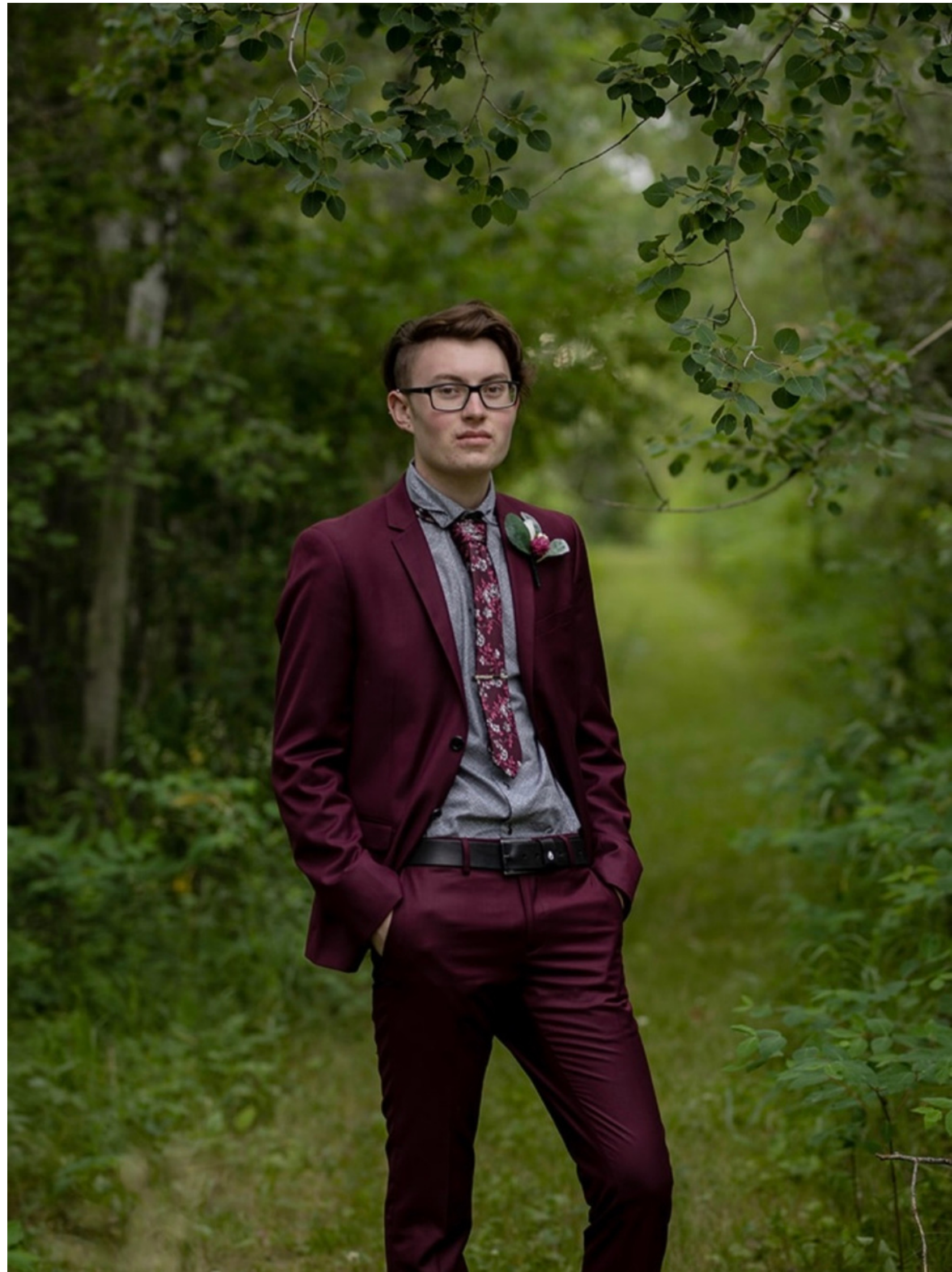
A member working for the members